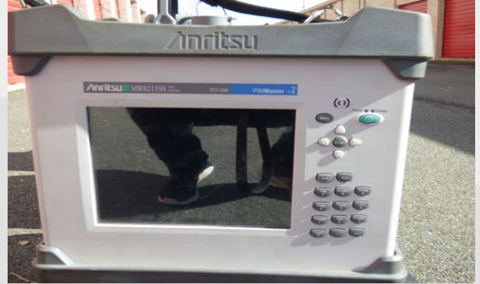
Storage Unit 1