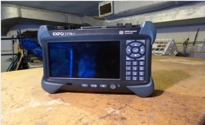
Storage Unit 1