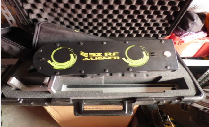
3ZRFA-1000-P Aligner - Antenna Alignment Tool