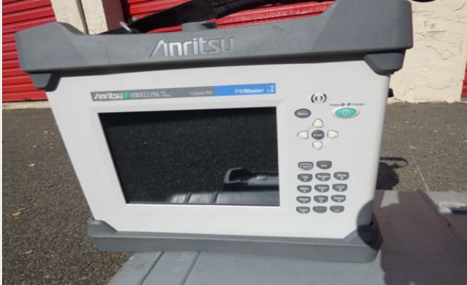
EXFO FTB-720, Optical Time-Domain Reflectometer

Anritsu MW82119A, Options: 0190-0031 – PCS1900, GPS Receiver