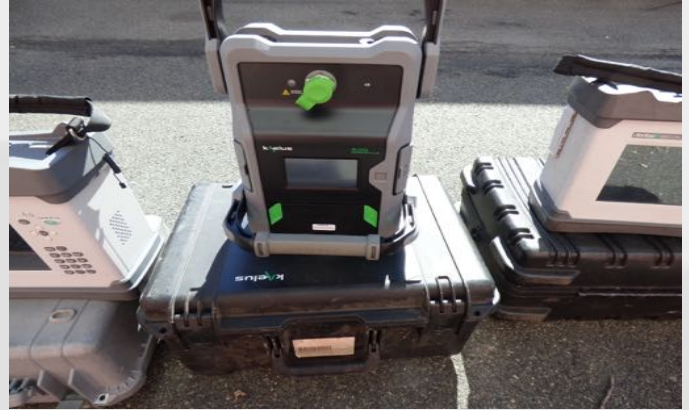
Kaelus IPA-1921A - Portable Passive Intermodulation (PIM) Analyzer.