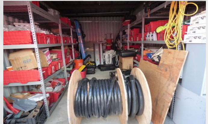
Storage Unit 1